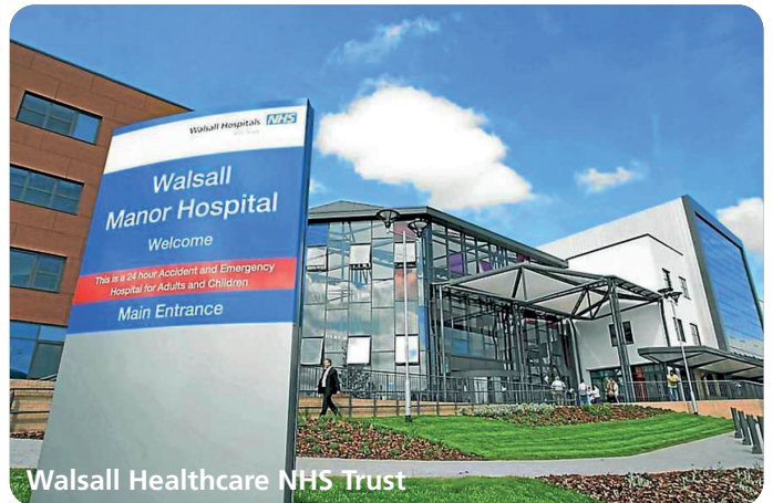
Walsall Healthcare NHS Trust