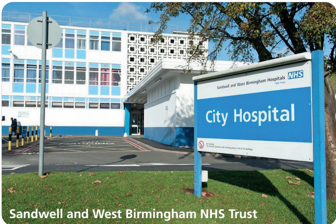
Sandwell and West Birmingham NHS Trust