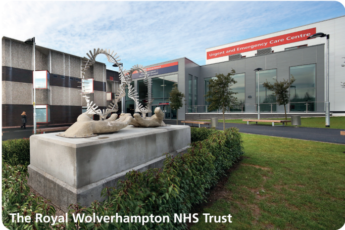
The Royal Wolverhampton NHS Trust