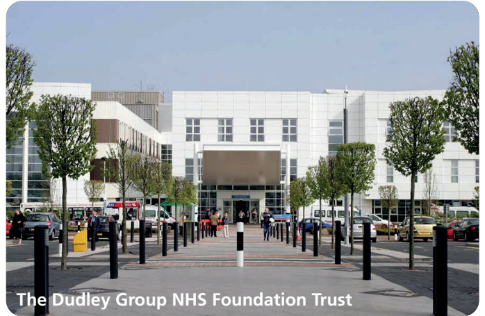
The Dudley Group NHS Foundation Trust