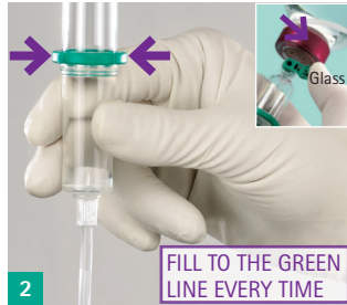
2 Squeeze the drip chamber and fill to the green line. When using rigid containers, open the venting cap.