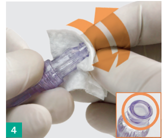
4 Decontaminate the needlefree access surface which you will be attaching SafeSet to. The needlefree should be cleaned vigorously for at least 15 seconds in accordance with epic3 guidelines (or in accordance with local policy). Allow the needlefree to air dry prior to connecting SafeSet.