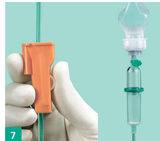
7 Open the roller clamp to the desired flow rate.