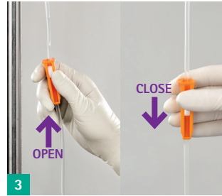
3 Open the roller clamp and allow the line to prime. Once the line is fully primed, close the roller clamp.