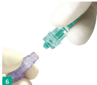
6 Attach the infusion line to the patient's vascular access device using a non-touch technique.