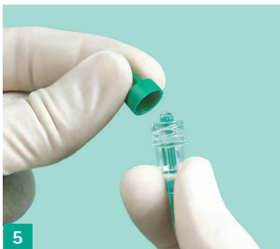
5 Remove the green PrimeStop cap.